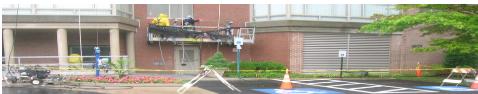
Caulking on VPE brickwork continued all summer.