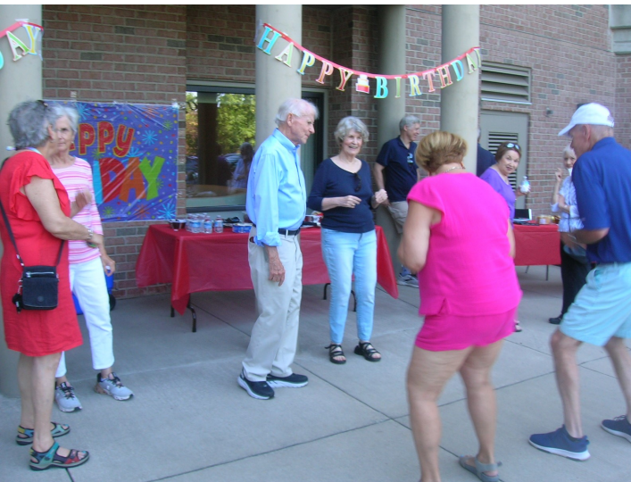
There was dancing.