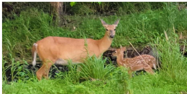
Visitors at VPE

The Building & Grounds Committee did approve an invoice for emergency generator maintenance