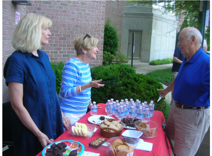
There were cakes.