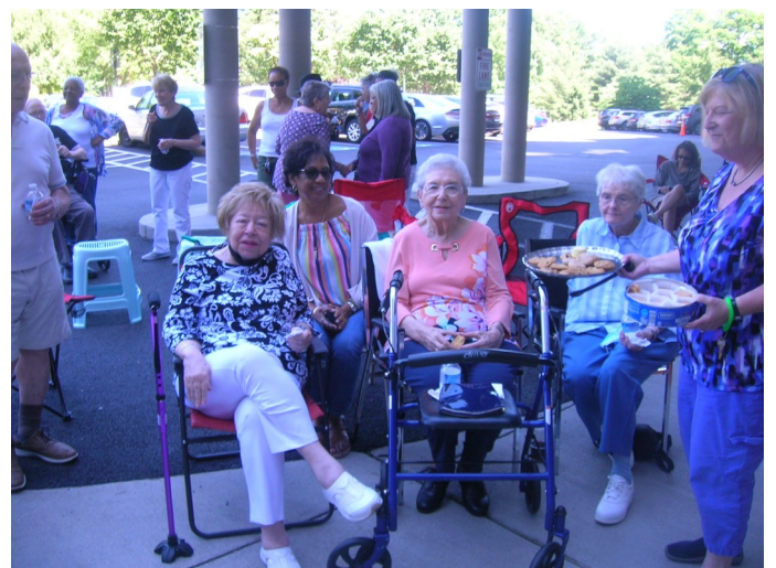
And the people were