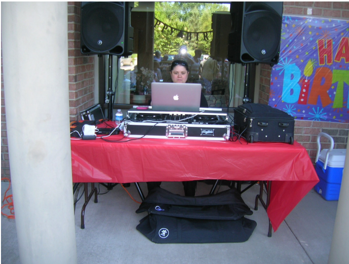
There was music.

The Birthday Bash in June was a big success.